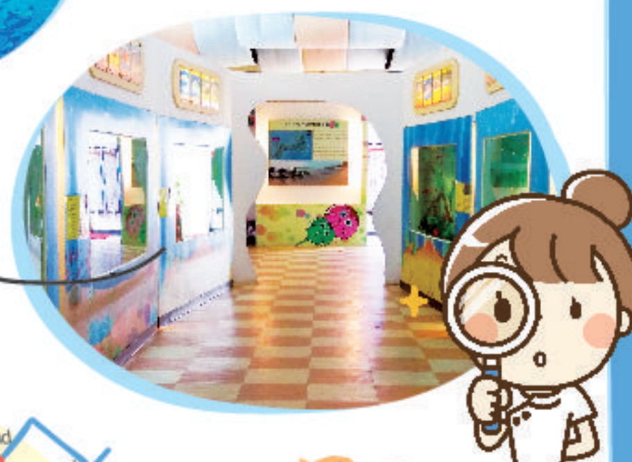
Horseshoe Crab Ecology Museum