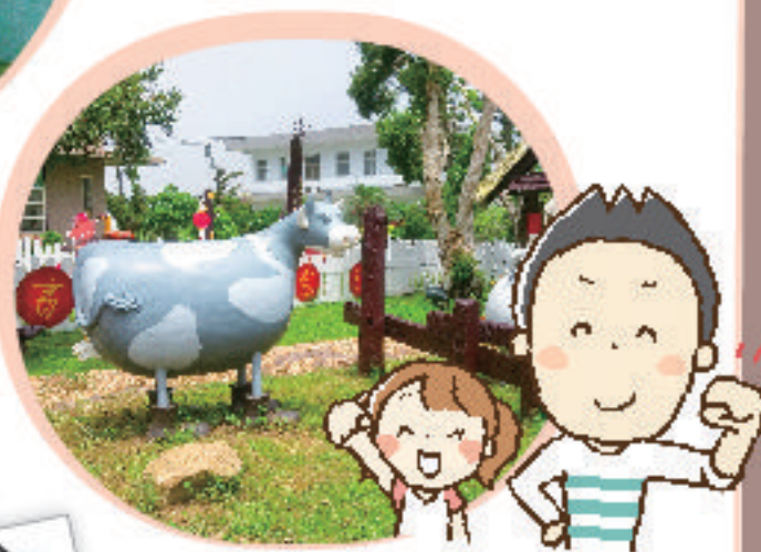
Livestock Exhibition Hall