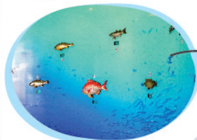
Aquarium & Ornamental Fish Show