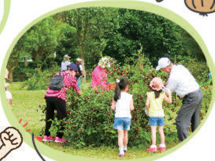
Picking mulberries with family