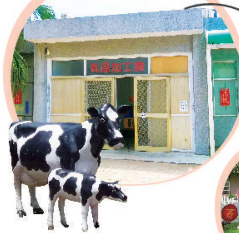
Dairy Processing Factory