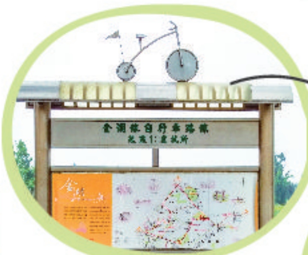
Tour the Park on Tandem Bike