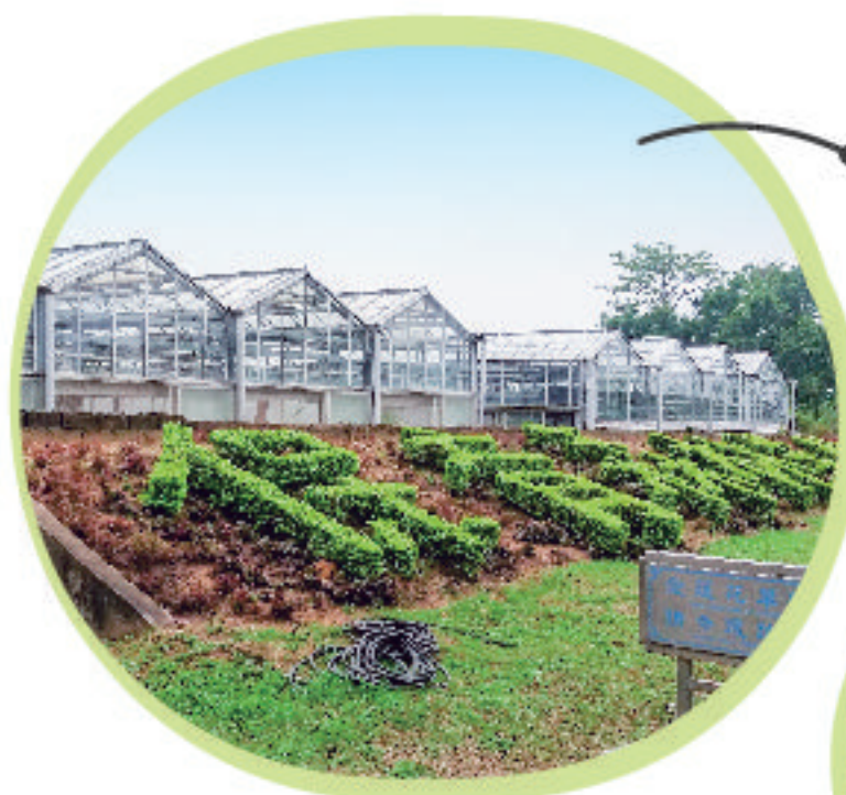
Nursery and Greenhouse